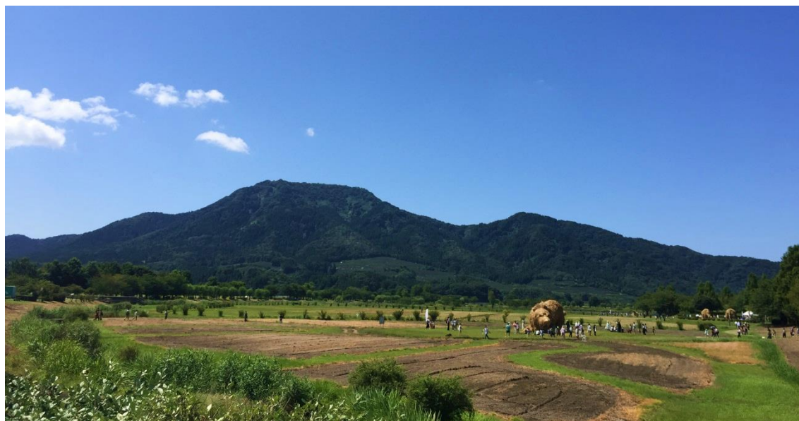
Uwasekigata Park full of nature.

One of the best parts of the Wara Art Festival is its location. Spend a relaxing day surrounded by lush and beautiful nature at this huge park.