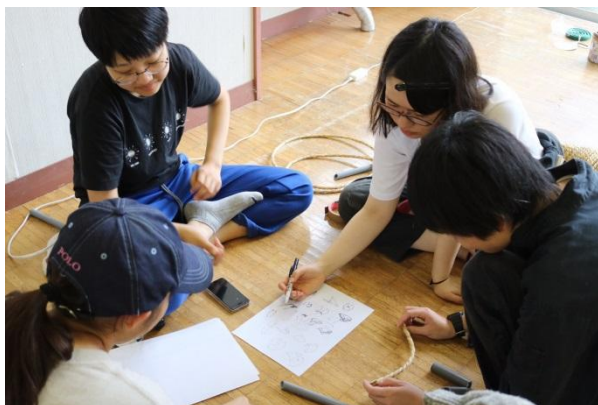
Students at Musashino Art University who are producing.