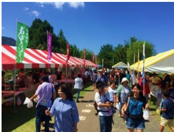
Local product market.

Aside from the exhibition, the festival is filled with plenty of things to do, such as the Nishikan Market with local craft beer and other Niigata specialties, an outdoor gallery of photos of past festivals' sculptures, a hands-on rice straw craft workshop, and more.