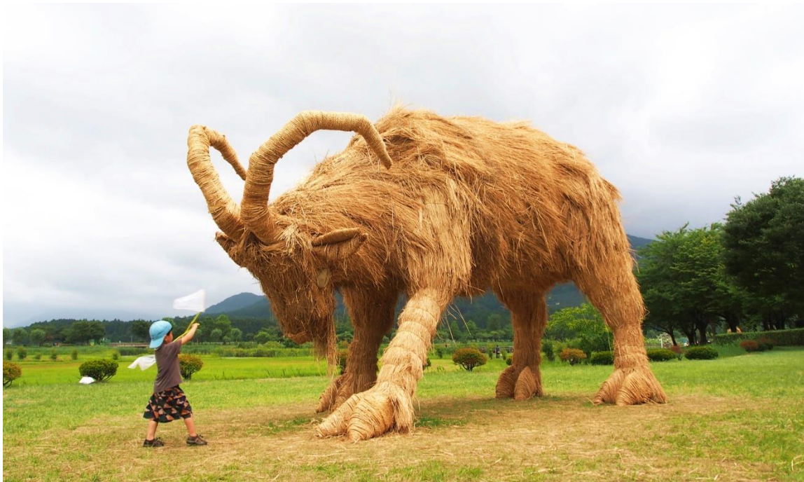
Huge object made of rice straw the "Wara Art"

Join us for a late summer day of carefree fun and enjoy the wonderful smell and feel of rice straw.